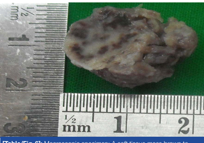
[Table/Fig-6]: Macroscopic specimen: A soft tissue mass brown to blackish white in color with regular borders, smooth in surface and firm in consistency