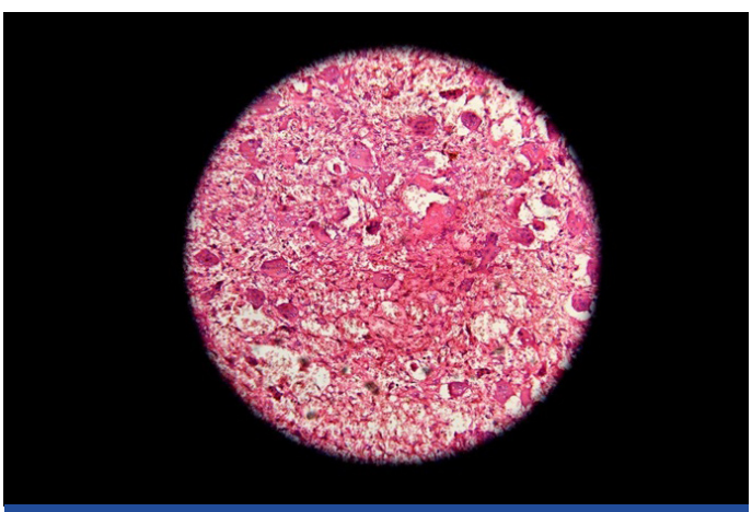
[Table/Fig-7]: Microscopic view of the excisional biopsy specimen showing abundant giant cells in a fibrous stroma along with fibrohistiocytic proliferation (H&E, 40x)

abundant giant cells in a fibrous stroma along with vesiculated fibrohisticcytic proliferation. Evenly dispersed giant cells, each having 2 to 8 nuclei in them, which were in close approximation with the proliferating blood vessels, which were admixed with areas of haemorrhage, were observed [Table/Fig-7]. On the high power field (HPF), 2-3 giant cells were seen.