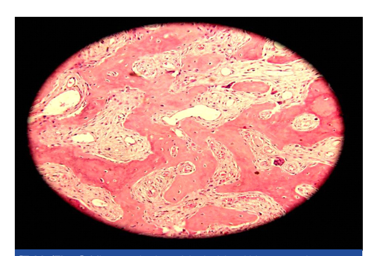
[Table/Fig-5]: Microscopic view of the incisional biopsy specimen showing, interconnecting bony trabeculae that are irregular in shape, lined by osteoblastic rimming at few places and resembling chinese letter pattern. (H&E, 40x)

were arranged in the fibrous stroma with extravasated erythrocytes [Table/Fig-5]. It was reported as Fibrous dysplasia.