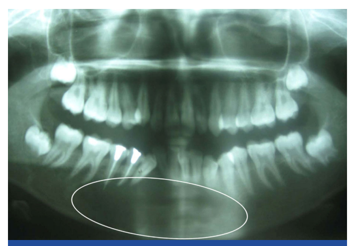
[Table/Fig-3]: OPG reveals a diffuse, multilocular, radiolucent lesion extending from 34-46, with root resorption and flaring of roots i.r.t 43, 44, and 45