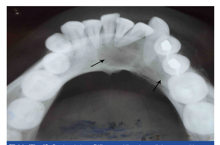
[Table/Fig-2]: Occlusal view: Diffuse multilocular radiolucency with periapical resorption areas i.r.t 32, 31 crossing the midline and extending from 41-46

An incisional biopsy was carried out under local anaesthesia, on the buccal side of the lesion, through the thick covering of the bone and a soft tissue specimen was sent for histopathologic analysis. In the gross examination, a tan brown, elliptical tissue which measured 0.5*0.5*1.0 cm, which was hard in consistency, was observed. The microscopic examination revealed irregularly shaped bony trabeculae that were not connected to each other and they had assumed curvilinear shapes (a Chinese letter pattern appearance). These bony trabeculae lacked the osteoblastic border and